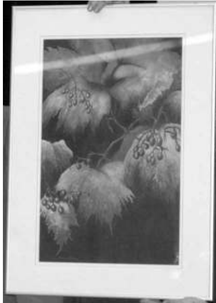
3rd Place: Dolores Billings