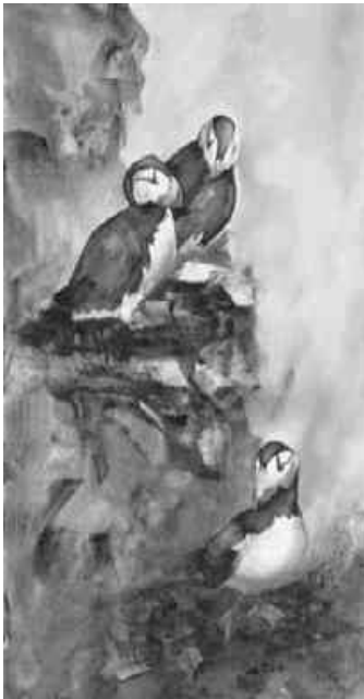
By Pat Hitchens

Call for Artists as Volunteer Panelists — A roundtable of panelists speaking on various topics pertinent to well-informed artists is in the planning stages for the EAFA February 2008 Members meeting. Topics to be discussed are: 1) Importance of Good Photography of Artwork and “how-to” tips and guidelines for accomplishing it; 2) Self-Promotion Tools and Portfolio Basics; 3) Getting into Juried Shows, Fairs, Festivals, and Exhibitions (timeline set-up; pricing of artwork; framing guidelines, shipping tips, etc.) and 4) Inventory Tracking. Each panelist will speak approximately ten to fifteen minutes after which a question and answer period will be held. Panelists will need to have hand-outs of tips and guidelines on their topics. These will be loaded on EAFA’s website for easy access. The program can only go forward with the help of those who are able to volunteer and are interested in sharing their knowledge and expertise. If you would like to participate, please call Program Chairperson Lynn Coyle at (425) 453-1861 who is coordinating the program set-up.