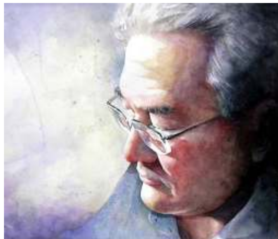
2D Award Kaz by Seiko Konja

Hundreds of artists and well-wishers braved inclement weather to say a fond farewell to outgoing Mayor Rosemarie Ives and to open the RedmondLights Celebration at Redmond City Hall, Sunday, December 2. The occasion was the awards ceremony for EAFA's 32nd Annual Exhibition, one of the City's featured events to kick off the Holiday season. In presenting the awards to those singled out among the 100 artists whose works are on display, Mayor Ives said that the City was very pleased with the exhibition and that visitors have responded to the exhibition with a "sense of joy."